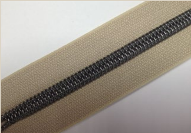
GUN METAL / CANNA DI FUCILE