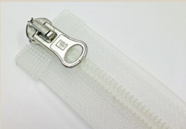
TRANSPARENT / TRANSPARENTE