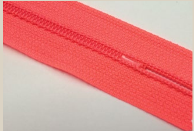
WELDED STOPS / TERMINAL SOLDADO ARRÊTS SOUDÉS / TERMINALI TERMOSALDATI