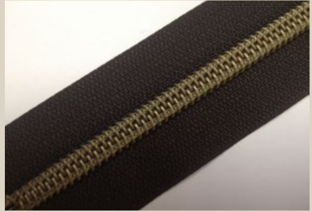
OLD GOLD / ORO ENVEJECIDO / OR VIELLI / ORO CHIARO