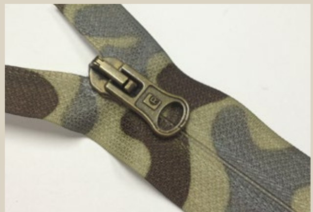
CAMOUFLAGE / CAMUFLAJE / MIMETICO