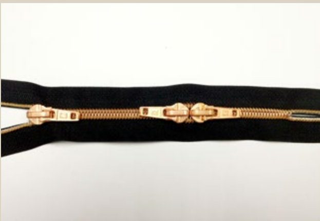
TRIPLO SLIDERS CLOSED END "TRIO" / TRIPLE CURSOR CERRADO "TRIO" TRIPLE CURSEUR FIXE "TRIO" / TRIPLO CURSORE FISSA "TRIO"