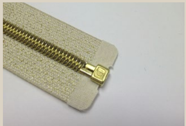
REINFORCEMENT TAPE / REFUERZO TEXTIL RENFORT TEXTILE / RINFORZO DIVISIBILE TAFFETAS