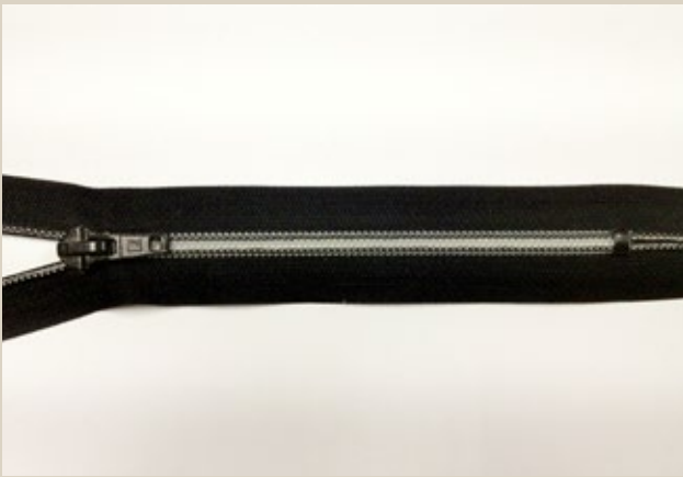
CLOSED END / CERRADO / FIXE / FISSA