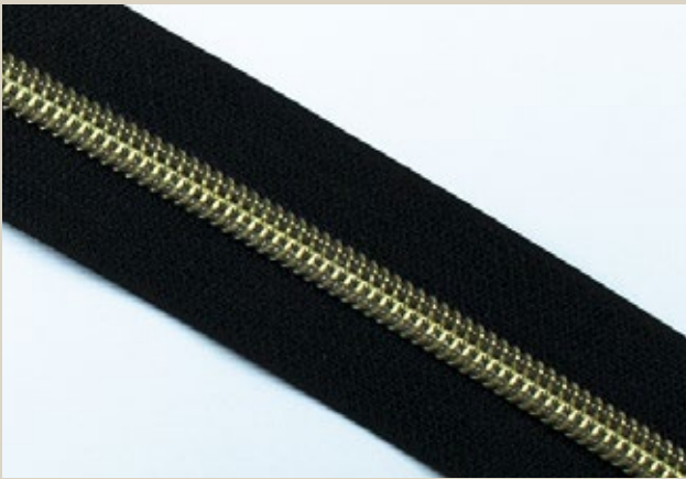
LIGHT GOLD / ORO CLARO / OR CLAIR / ORO CHIARO