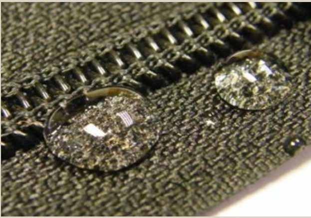
WATER-REPELLENT / HIDROREPELENTE REPOUSSANT L'EAU / IDROREPELENTE