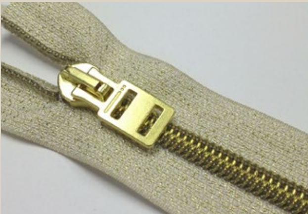
LUXE (GOLD / ORO / OR)