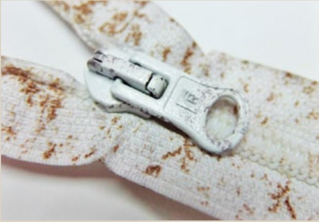
SUBLIMATION / SUBLIMACIÓN / SUBLIMATION / SUBLIMAZIONE