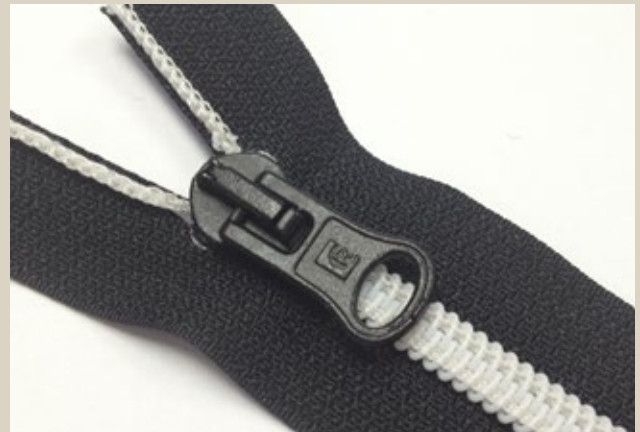
BICOLOUR / BICOLOR / BICOLORE