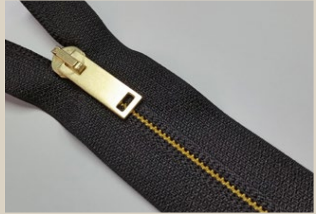
FANTASY CHAIN OPEN SEWING