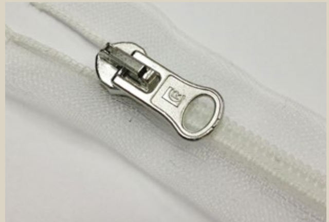
TRANSPARENT / TRANSPARENTE