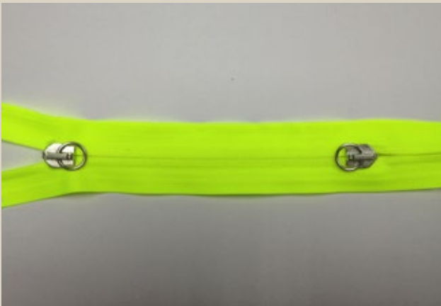
TWO WAYS CLOSED END "X" / DOBLE CURSOR CERRADO "X" DOUBLE CURSEUR FIXE "X" / DOPPIO CURSORE FISSA " X "