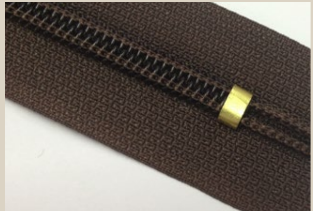
BRASS PLATED STOPS / TERMINALES PULIDOS