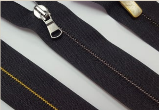
FANTASY CHAIN OPEN SEWING