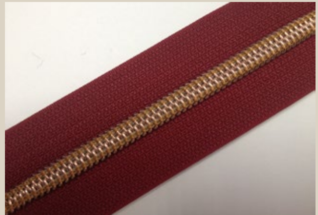
COPPER / COBRE / CUIVRE ROUGE / RAME