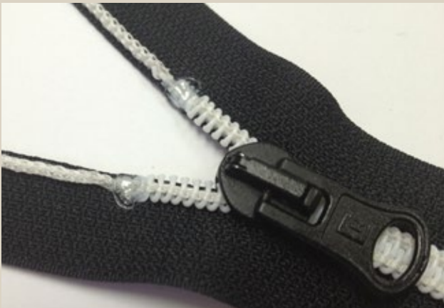
WELDED STOPS / TERMINAL SOLDADO ARRÊTS SOUDÉS / TERMINALI TERMOSALDATI