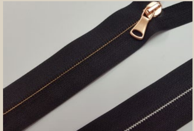
FANTASY CHAIN OPEN SEWING