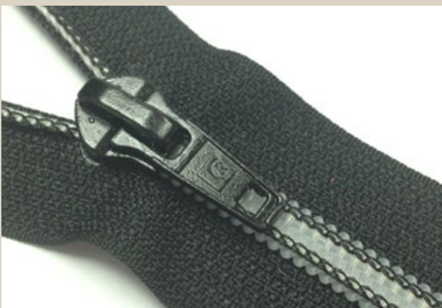
TRICOLOUR / TRICOLOR / TRICOLORE