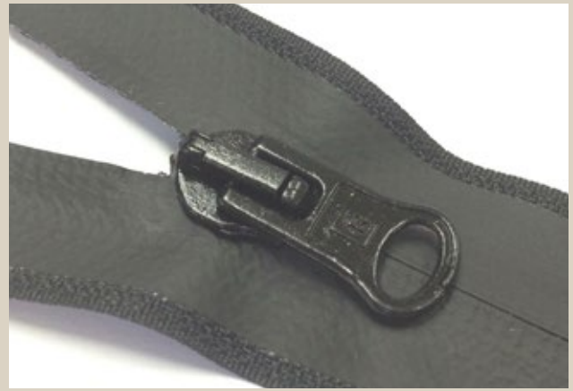
WATERPROOF / IMPERMEABLE ÉTANCHE / IMPERMEABILE