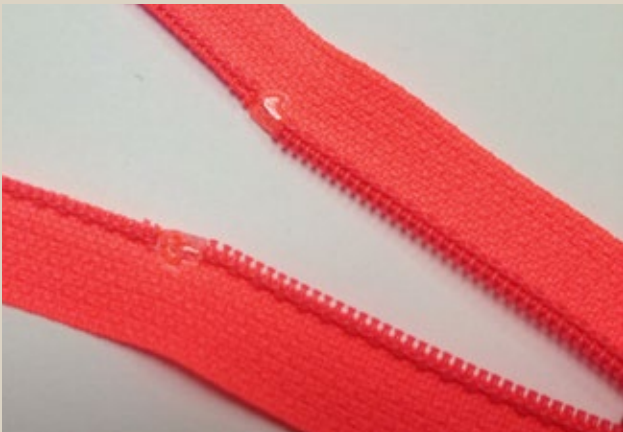
WELDED STOPS / TERMINAL SOLDADO ARRÊTS SOUDÉS / TERMINALI TERMOSALDATI