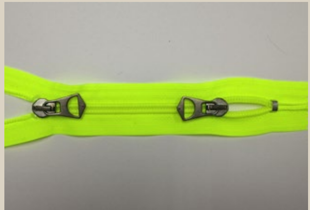
TWO WAYS CLOSED END "MONO" / DOBLE CURSOR CERRADO "MONO" DOUBLE CURSEUR FIXE "MONO" / DOPPIO CURSORE FISSA " MONO "