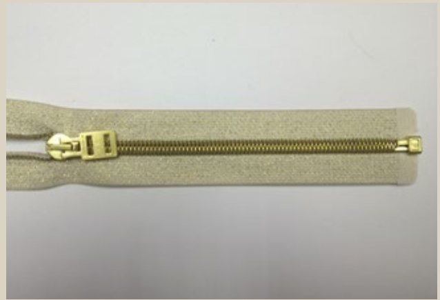
OPEN END / SEPARADOR / SÉPARABLE / DIVISIBLE