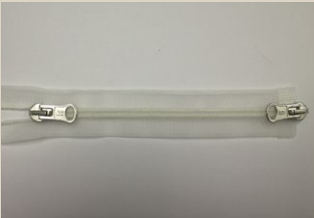
TWO WAYS OPEN END "DCS" / DOBLE CURSOR SEPARADOR "DCS" DOUBLE CURSEUR SÉPARABLE "DCS" / DOPPIO CURSORE DIVISIBILE "DCS"