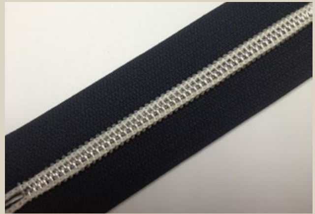
SILVER / PLATA / ARGENT / ARGENTO