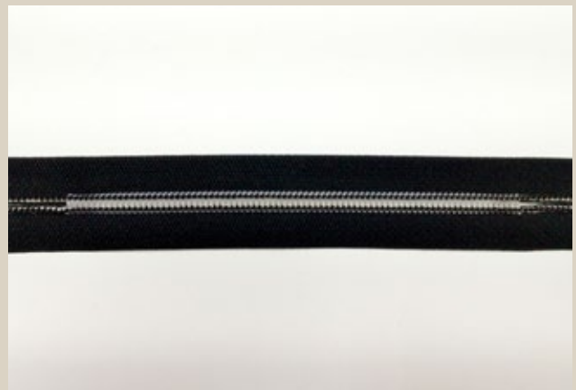
EMBELLISHMENT / ADORNO ORNEMENT / DECORAZIONE