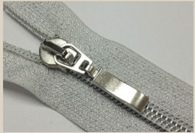
LUXE (SILVER / PLATA / ARGENT / ARGENTO)