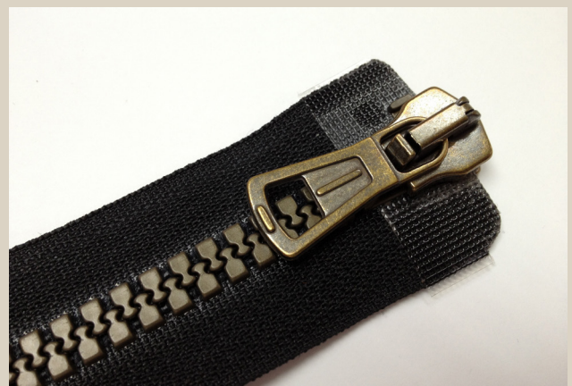
BLACK OLD BRASS / LATÓN ENVEJECIDO NEGRO LAITON VIEILLI BLACK / OTTONE VECCHIO BLACK