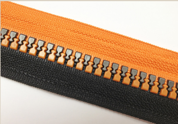
BICOLOUR / BICOLOR / BICOLORE