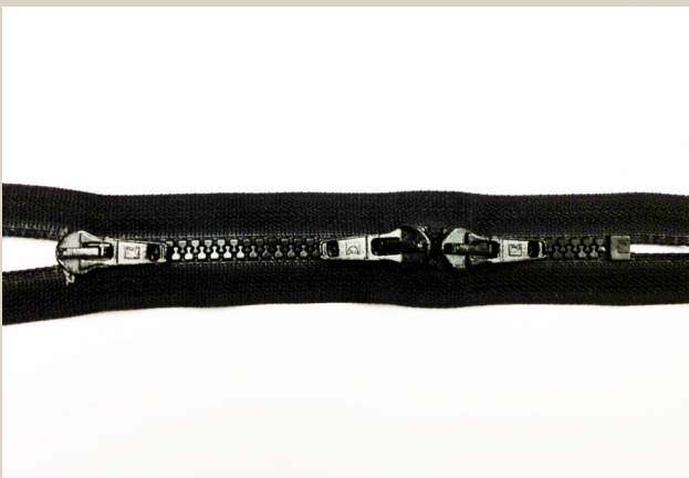
TRIPLO SLIDERS CLOSED END "TRIO" / TRIPLE CURSOR CERRADO "TRIO" TRIPLE CURSEUR FIXE "TRIO" / TRIPLO CURSORE FISSA "TRIO"