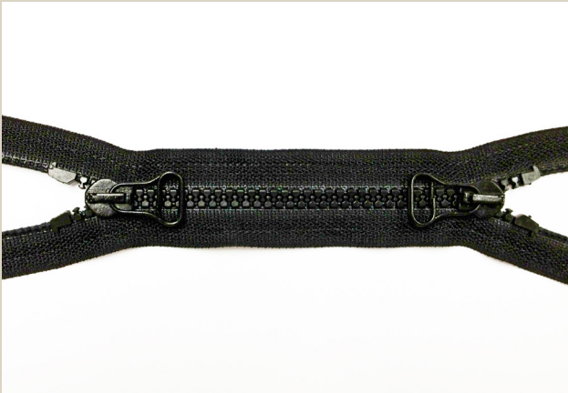
TWO WAYS CLOSED END "X" / DOBLE CURSOR CERRADO "X" DOUBLE CURSEUR FIXE "X" / DOPPIO CURSORE FISSA " X "