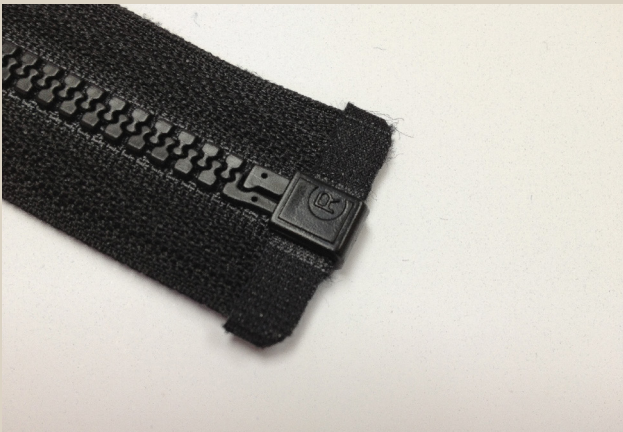
REINFORCEMENT TAPE / REFUERZO TEXTIL RENFORT TEXTILE / RINFORZO DIVISIBILE TAFFETAS