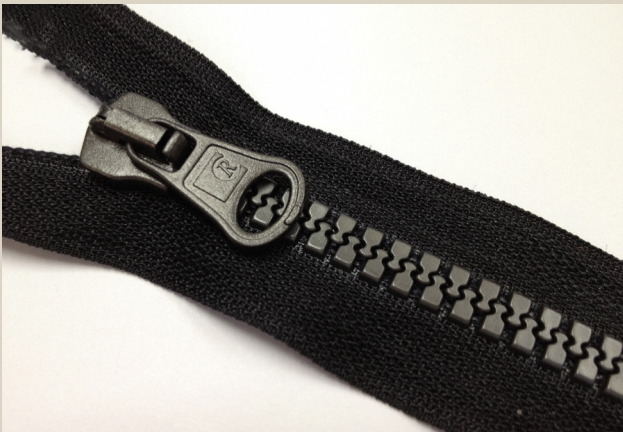
GUN METAL / TITÁN / TITANE