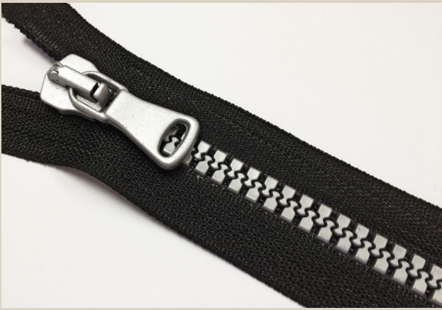
SILVER / PLATA / ARGENT / ARGENTO