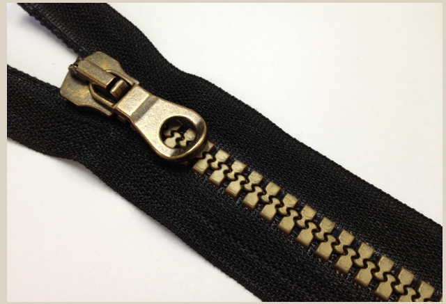
OLD BRASS / LATÓN ENVEJECIDO / LAITON VIEILLI / OTTONE VECCHIO