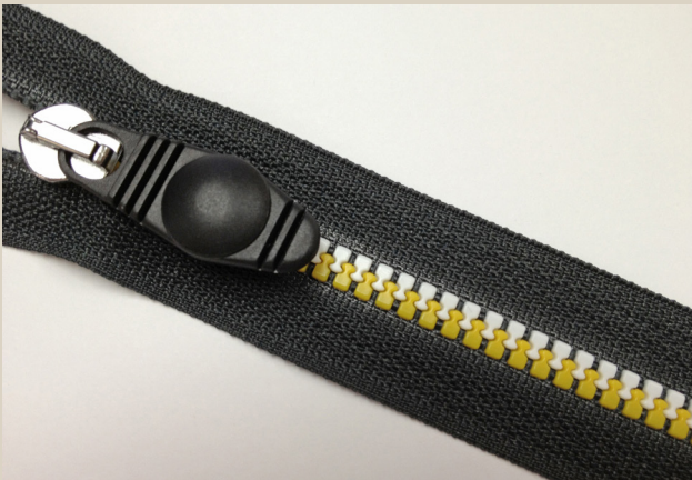
BICOLOUR / BICOLOR / BICOLORE