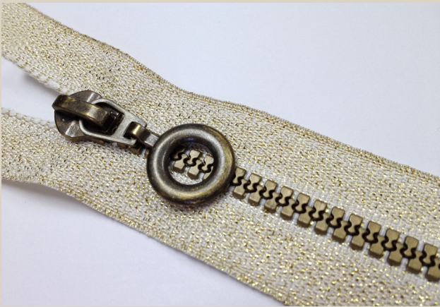
LUXE (GOLD / ORO / OR)