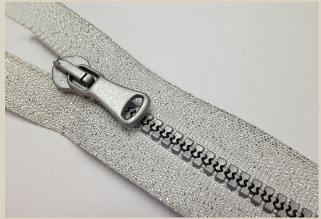
LUXE (SILVER / PLATA / ARGENT / ARGENTO)