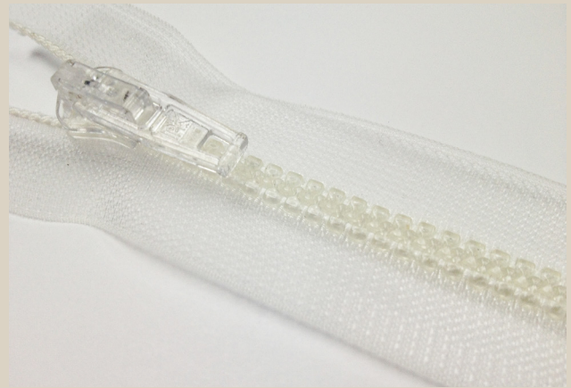
TRANSPARENT / TRANSPARENTE