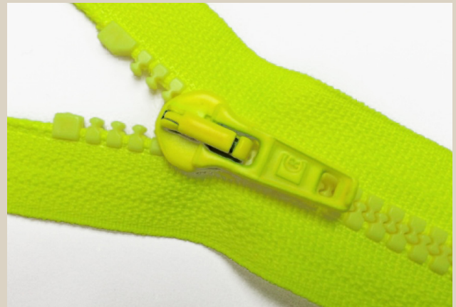
FLUORESCENT / FLUORESCENTE / FLUORESCENT / FLUORESCENTE