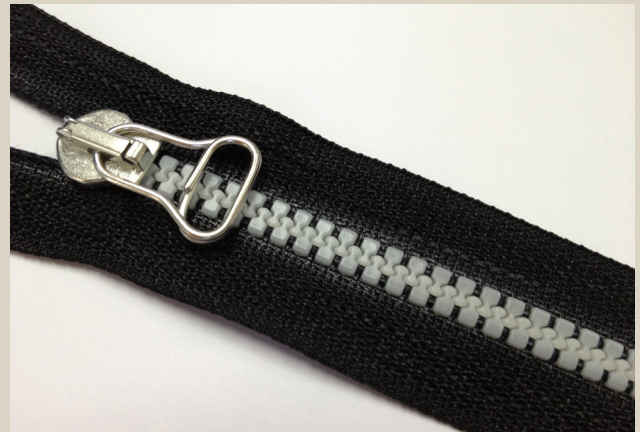
PHOSPHORESCENT / FOSFORESCENTE PHOSPHORESCENT / FOSFORESCENTE