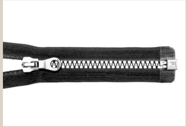
OPEN END / SEPARADOR / SÉPARABLE / DIVISIBLE