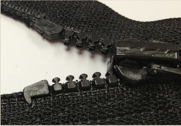
REINFORCED STOPS / TERMINALES REFORZADOS ARRÊTS RENFORCÉS / TERMINALE RINFORZATO