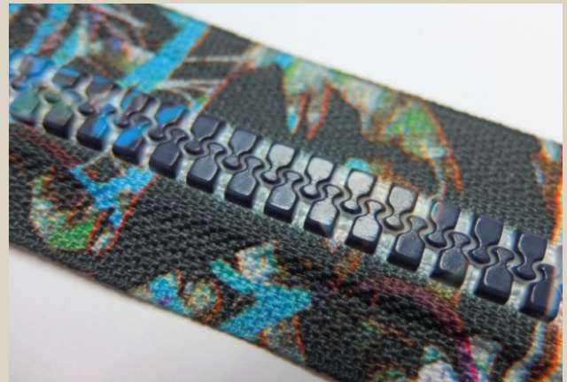
SUBLIMATION / SUBLIMACIÓN / SUBLIMATION / SUBLIMAZIONE