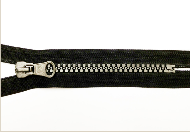
CLOSED END / CERRADO / FIXE / FISSA