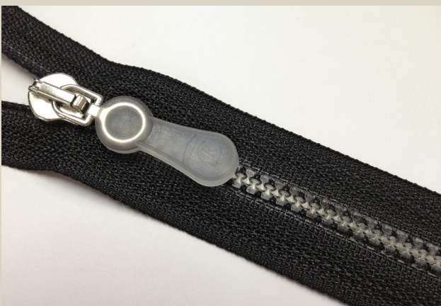
TRANSPARENT / TRANSPARENTE