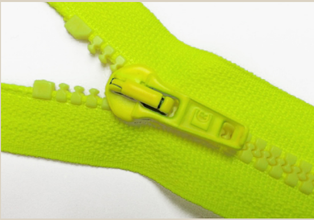
FLUORESCENT / FLUORESCENTE / FLUORESCENT / FLUORESCENTE