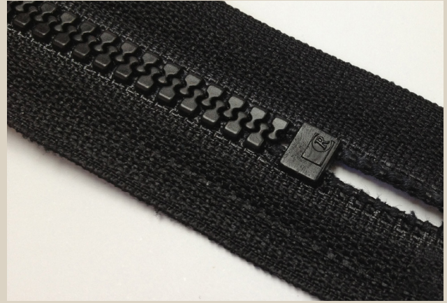
REINFORCED STOPS / TERMINALES REFORZADOS ARRÊTS RENFORCÉS / TERMINALE RINFORZATO