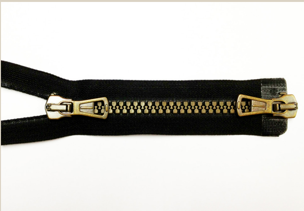
TWO WAYS OPEN END "DCS" / DOBLE CURSOR SEPARADOR "DCS" DOUBLE CURSEUR SÉPARABLE "DCS" / DOPPIO CURSORE DIVISIBILE "DCS"